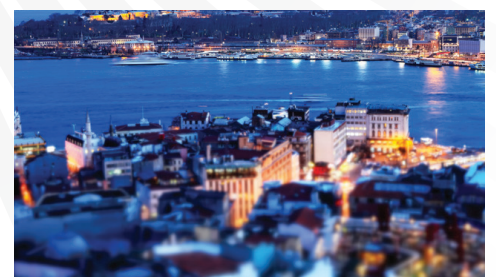
Boat Cruise Party on the Bosphorus