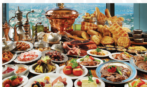
Traditional Welcome Dinner